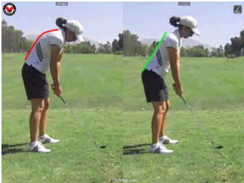
C-POSTURE Test - Over-head Deep Squat, Toe Touch, Lat test