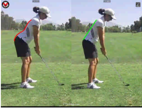
S-POSTURE Test - Pelvic Tilt