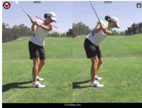
FLAT SHOULDER PLANE Test - 90/90, Torso Rotation, Lat Test, Half Kneeling Rotation