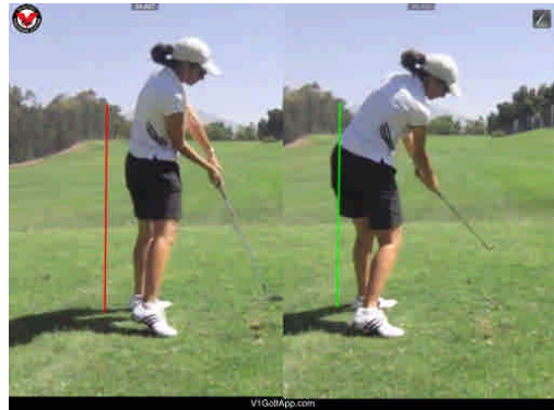
EARLY EXTENSION Test - Pelvic Tilt, Torso Rotation, Over-head Deep Squat, 90/90, Single Leg balance, Lat Test, Hip Int/Ext Rotation